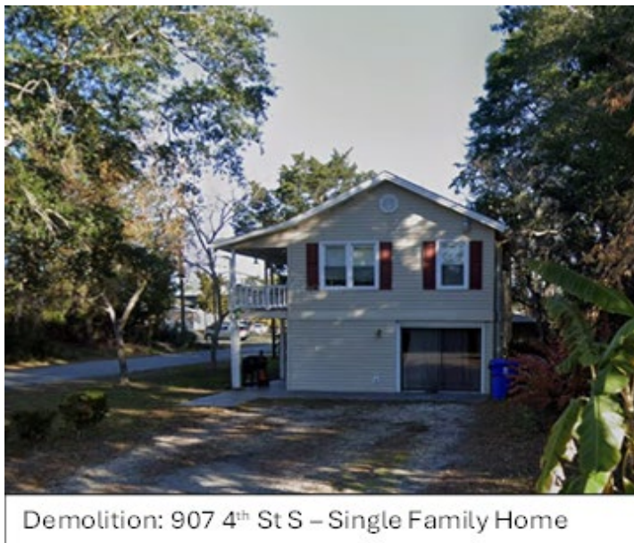
Demolition: 907 4 th St S – Single Family Home