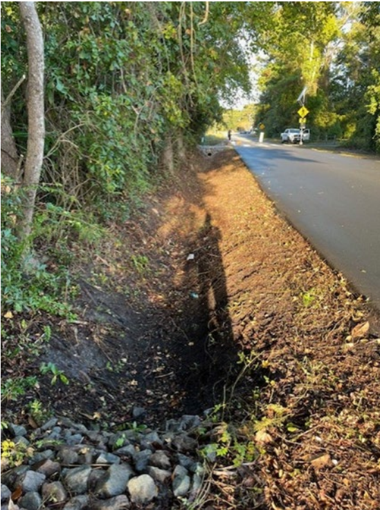
Stormwater crews clean ditch on the 700 block of Sumter Ave.