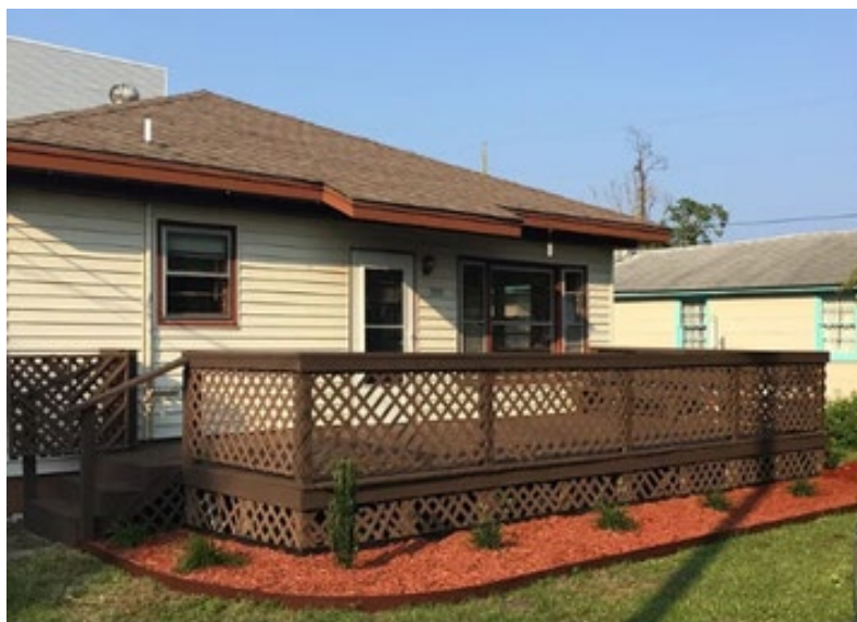
Demo: 502 Ocean – Single Family home