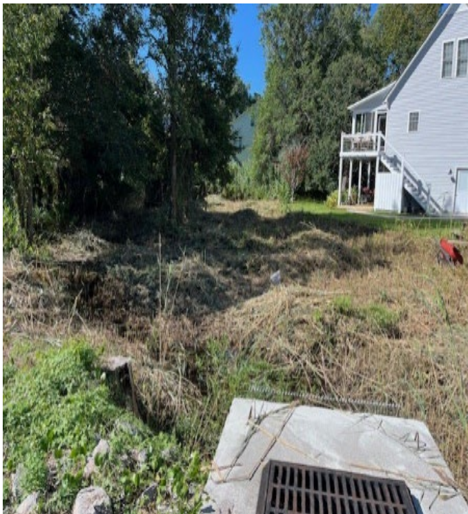
The phragmites has been cut from the ditch on Stain Joseph St.