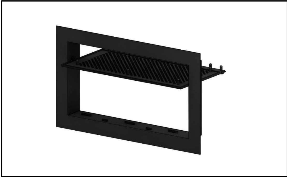
FIGURE 2—MODEL FFV-1608 FREEDOM FLOOD VENT™: SHOWN WITH FLOOD DOOR PIVOTED OPEN