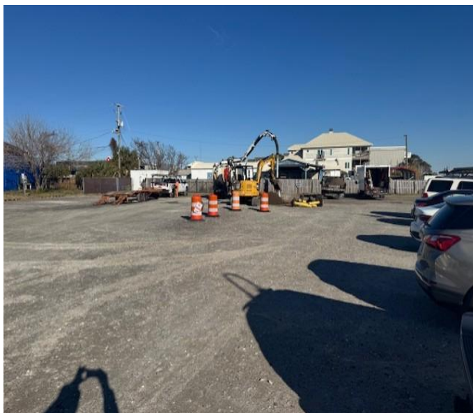
Crews prep Weeks lot for paving